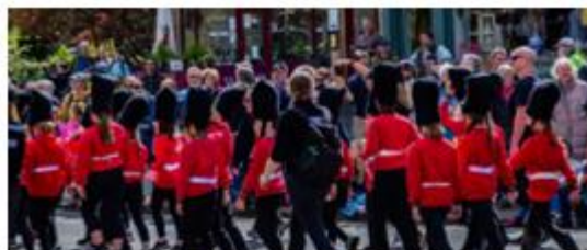
Carnival Parade 2023