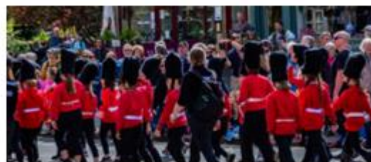
Carnival Parade 2023