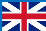
United Kingdom flag