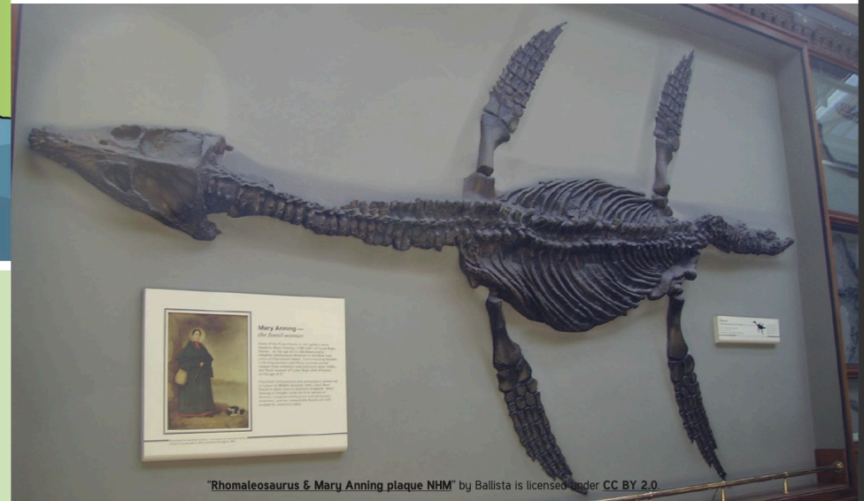
"Rhomaleosaurus & Mary Anning plaque NHM"

Mary Anning is still remembered today for her important work as a palaeontologist. There is a special sign on her home and a museum all about her in Lyme Regis.